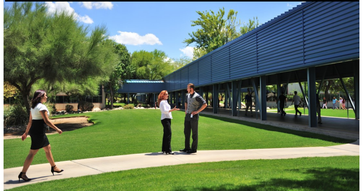
Nature Walks on the Spine