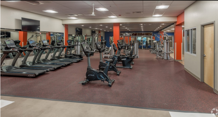
Fit Zona– Cardio & Weights